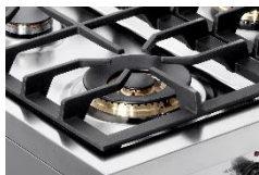
Brass Burners & Continuous Grates

Extra Large Oven Cavity, Soft Close Hinges, Glide Rack Included, Matching Color Control Panel, Temperature Indicator Gauge on Gas Models, 25 1/4" Depth, Induction Option Offered, Dual Halogen Lights, Round Handle.