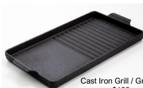
Cast Iron Grill / Griddle $129 (VEGRD100C)

Gas burner accessories enhance cooking precision.