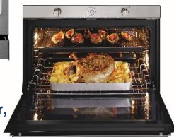
Extra-Large Oven Cavity

30" GAS COLOR OPTIONS: Stainless Steel Matte Black