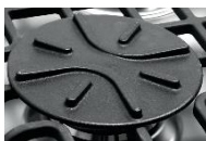
Simmer Plate $79 Minimizes BTU power for the most delicate heat setting. (VEMSIM)

Gas burner accessories enhance cooking precision.