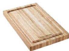
Cutting Board $99 (VECB9171)

Universal accessories to make prep and prepare a breeze.