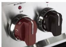
Optional Color Knobs Black or Burgundy