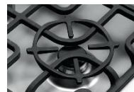
Pot Reducer $79 Grate support upport for smaller pots and pans (VEMSPR)

Customize your range with beautiful upgrades.