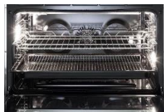
Dual Convection Fans (Dual Fuel, Induction & Electric Models)