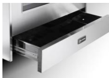
Pull-out Storage Drawer