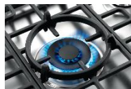
Wok Ring $59 Grate support rounded bottom wok-style pans. (VEWOK)